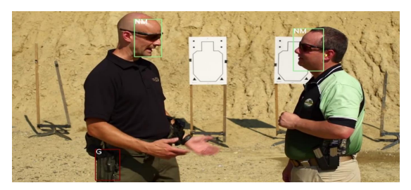
FIG. 7. The output image for detection of guns and masks.